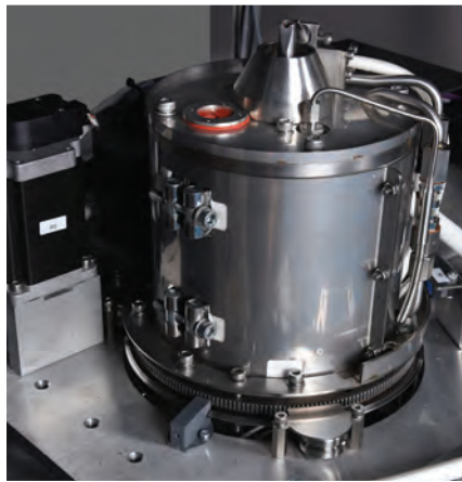
Rotatable non wettable nozzles avoiding operator interference/maintenance