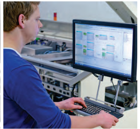
Easily programmable allowing a fast product set up

ITW EAE is a division of Illinois Tool Works, Inc. It is a consolidation of all of its Electronic Assembly Equipment and Thermal Processing Technology. The group includes world-class products from MPM, Camalot, Electrovert (Speedline), Vitronics Soltec and Despatch.